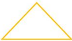
AP at MPT